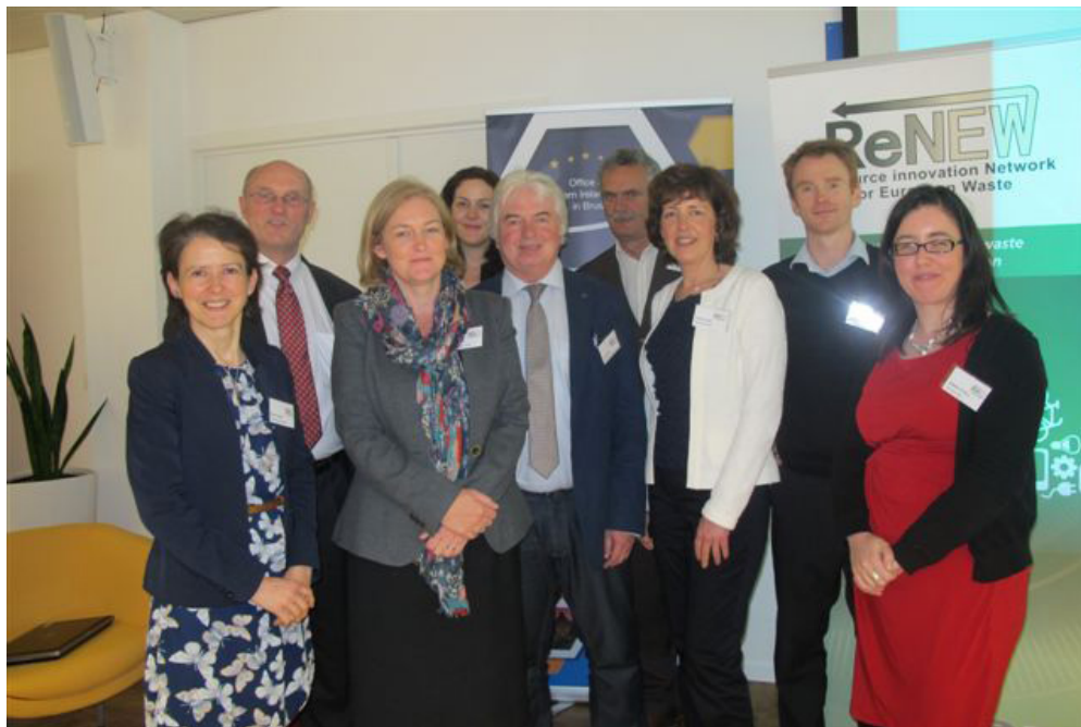
Pictured above is the Irish Delegation at the ReNEW workshop